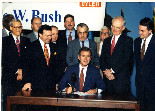
From UASC.UA.003. Marketing & Communications Records, Box 61 Folder 9.