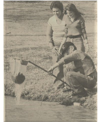
Members of the Environment and Man laboratory class conduct field studies of the campus lakes.

UT Tyler's Department of Special Services received a grant of $88,506 from the U.S. Department of Education to continue its bilingual teaching training program. The program facilitated bilingual certification for local high school instructors working with English-as-a-Second-Language students. The Office of Bilingual Education at UT Tyler sought the Federal grant in response to the Texas House Bill 246 (1981) which required all school districts with more than 20 ESL students to have certified bilingual instructors on staff.