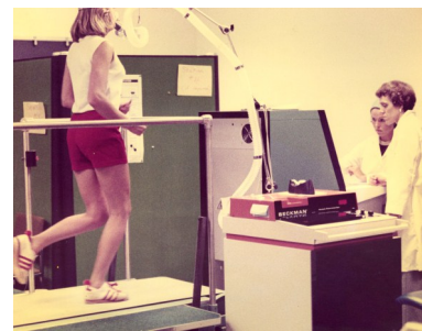
Undated photo from HPE Human Performance Laboratory.