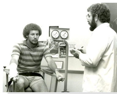
Undated photo from HPE Human Performance Laboratory.