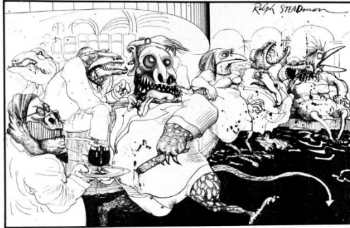
Figure 2: Lizard Lounge (Illustration by Ralph Steadman)

press table as crazed lizards spilling blood throughout the hotel bar. The text is highlighted by Ralph Steadman's gruesome illustrations such as the photo below of Thompson's hallucination.