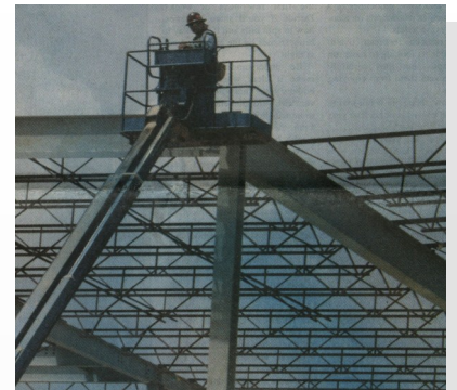
Construction of the Herrington Patriot Center, under way in August 2002. UT Tyler students could watch the progress broadcast live on the University website.

The classes could be used "for academic credit or self-fulfillment". Special course offerings included "It's Only a Game: Why We Love our Sports" (HIST 4199), "Opera Appreciation" (MUSI 4199), "Computer Security and Cryptography" (COSC 4199), and "Dollars and Sense" (FINA 4199).