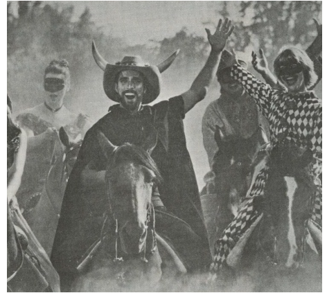
UT Tyler and Tyler Junior College jointly hosted Mozart's Marriage of Figaro by the Texas Opera Theater in Wise Auditorium, February 3.

UT System formally approved six grants totaling $225,155 for programs, including a Supplemental Educational Opportunity Grants Program, Bilingual Education Teacher Training Program, College Work Study Program, National Direct Student Loan Program, and two TEA grants for summer workshops lead by UT Tyler faculty.