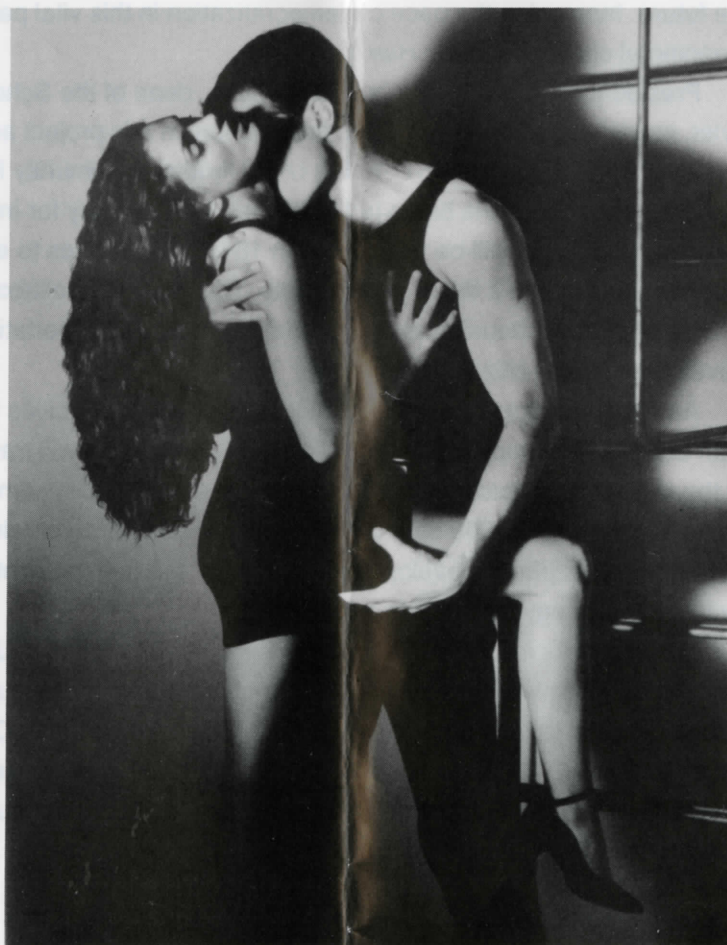
"West Side Story" National Touring Production

Jerome Robbins' original direction and Tony Award-winning choreography will be reproduced for this production which boasts a cast of the most energetic young performers ever assembled. For more information contact the Cowan Center Box Office, 566-7424.