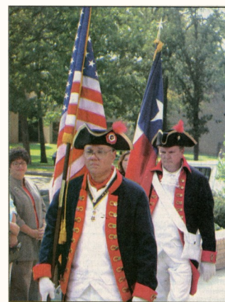
The Sons of the American Revolution present the flags before a crowd gathers to celebrate Constitution Day on Sept. 20, 2005.