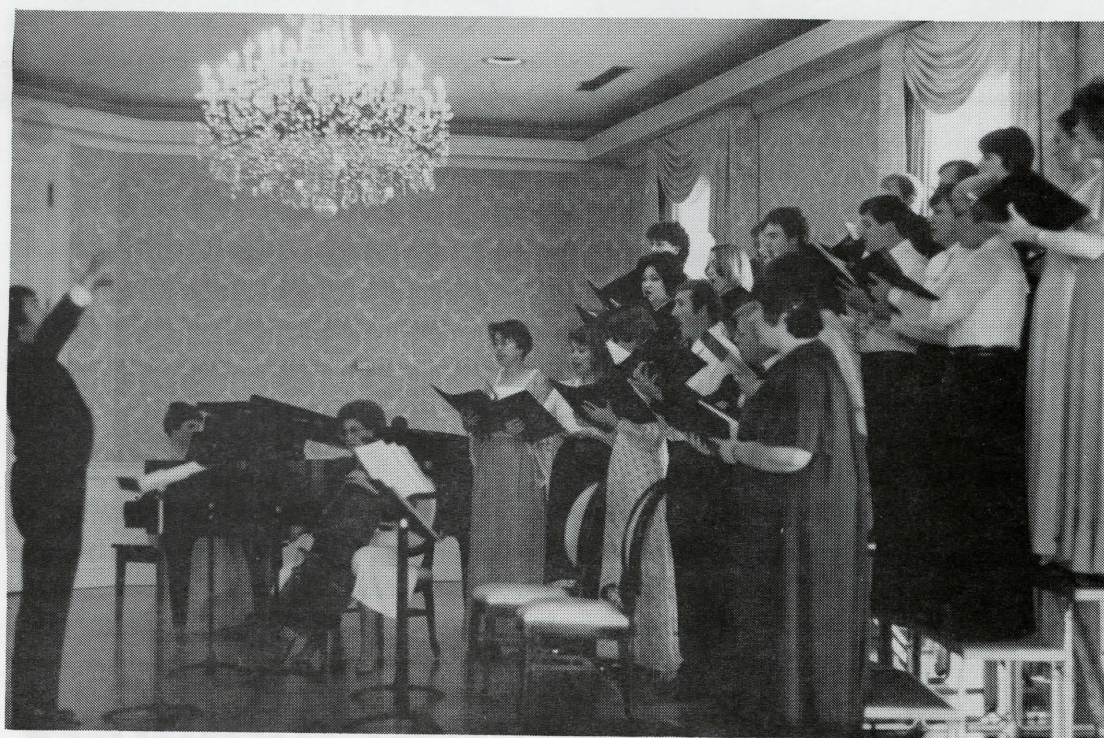
CONCERT—The U.T. Tyler Concert Chorale performs for the Tyler Women's Symphony League Feb. 26 at Willowbrook Country Club.

The concert ended with the audience giving the Cadets and director a standing ovation.