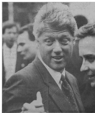
Presidential candidate Bill Clinton, Arkansas governor, greets supporters at Harvey Lake during a March 8 political rally.

Democratic Presidential Candidate Bill Clinton visits UT Tyler