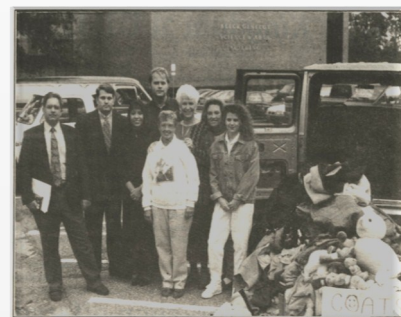
UT Tyler and TJC students meet to assemble their holiday donations of coats and stuffed animals.