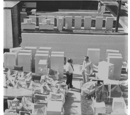
In 1976, Texas Eastern University moved from its original home (the old Roberts Junior High building on Berta Street) to its current location on University Boulevard.

The Student Association purchased an institutional membership from Video, Inc., which allowed students to screen films in the U.C. from 8 a.m. to 5 p.m. every day. The U.C. collection included over 300 films, which students could select on a first come, first serve basis.